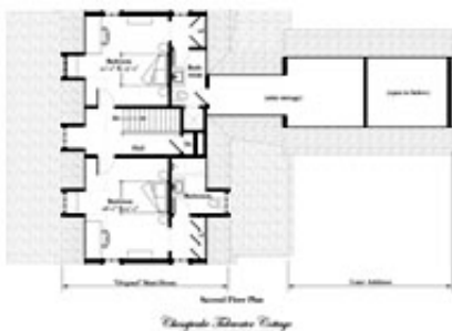
Russell Versaci Architecture

Versaci's 2008 version of the Chesapeake Tidewater house is somewhat bigger than the original, with 2,450 square feet, but the proportions and the basic layout are the same. The main part of the house is divided between a first-floor master suite and an updated "keeping room" that includes a modern kitchen.