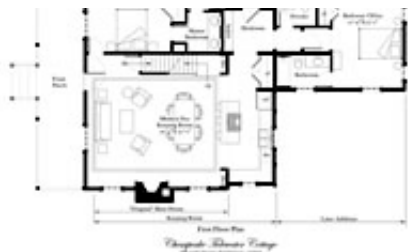
Russell Versaci Architecture

First-floor plan of the updated Chesapeake Tidewater Cottage. In the old days the front porch was the center of household activity during the hot and humid summer months. The "keeping room" was where all household activities took place when it was colder.